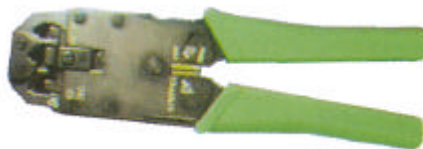
Part Number Description T1571 Crimping Tool T1572 Replacement Blades

This heavy duty ratchet all metal deluxe tool will crimp all size modular plugs from 4 to 8 way. Also has inbuilt cutters and wire stripper that strips to accurate length for plugs.