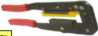
Part Number T1540

Suits all IDC cable connectors. Commonly used for connecting items such as SCSI and IDE computer plugs. Don't destroy connectors with a vice or hammer, crimp them the easy way. Crimping distance from 27.5mm to 6mm (with attachment).