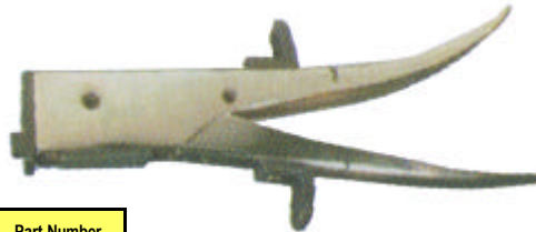
Part Number T2355

Suitable for cutting odd shaped holes in steel, plastic and aluminium. Capacity: Steel - 1mm Aluminium - 1.6mm Great for making one off chassis, panels etc.