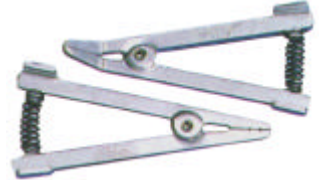
Part Number T2620

Spring-loaded, plier-grip clips for heat sensitive components and leads. Made of aluminium for high thermal conductivity, two types (one straight, one angled) both are 75mm long.