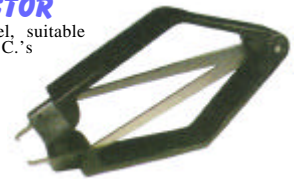
Part Number T2570

Insulated spring steel, suitable for use on all PLCC I.C.'s