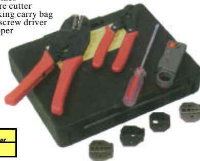
Part Number TSA55

Coaxial connector crimping tool kit. Supplied with 5 different size crimping jaws. Designed to crimp BNC and TNC connectors to cable ranging from 7C2V up to RG8 and the regular sizes like RG58C/U and RG62 coaxial cables. Insulated handle and 6 position tension adjustment. - Five jaw sizes - Handy wire cutter - Latch locking carry bag - Flat head screw driver - Wire stripper