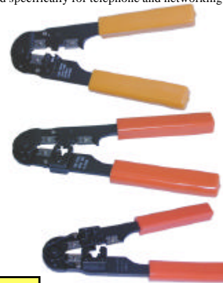
Part Number MCT4

Steel construction modular connector crimping tools. Doubles as a handy cutter or splicer. Designed specifically for telephone and networking cables.