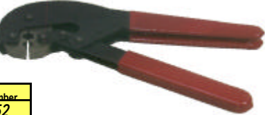
Part Number TSA52

9" heavy duty "F" connector crimp tool to crimp RG59 and RG6 cable. This handy tool can also be used with other crimp connectors using this size cable. Simple two jaw clamping system.