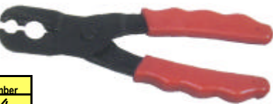
Part Number TSA34

Metal handle "F" connector crimping pliers. Red PVC boot covers the handles. Features include hardened jaws and spring return handle. Length: 145mm/6.5".