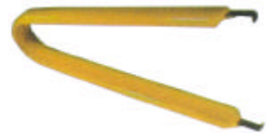
Part Number T2550

Insulated spring steel, suitable for use on 8-40 pin I.C.'s