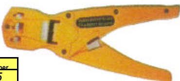
Part Number T1565

This crimping tool will crimp all size modular plugs from 4 to 8 way. Incorporates cutters and wire stripper that strips to accurate length for plugs.