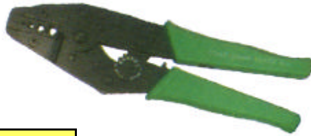
Part Number GS600

Coaxial connector crimping tool with 5 jaws. Designed to crimp BNC and TNC connectors to RG58C/U and RG62 coaxial cable and the centre pin to the centre conductor. - Insulated handle and tension 6 position adjustment - Hex sizes: 1.7, 2.5, 5.4, 6.5, 8.2mm