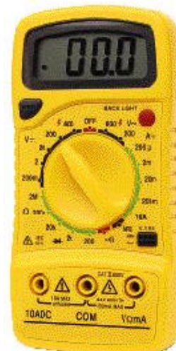
Part Number QM1522

Specifications: DC Voltage: 200mV, 2V, 20V, 200V, 600V \pm 0.5\% . Overload protected 250V RMS for 200mV range. 600V DC RMS AC for other ranges. DC Amps: 200 \mu A, 2mA, 20mA, 200mA, 10A \pm 1\% on most ranges. Overload protected (not 10A). AC Volts: 200V, 600V, \pm 1.2\% . Overload protected. Resistance: 200 \Omega , 2K \Omega , 20K, 200K, 2M \Omega \pm 0.8\% . Dimensions: 138 x 69 x 31mm Overload protected. Diode and transistor test.