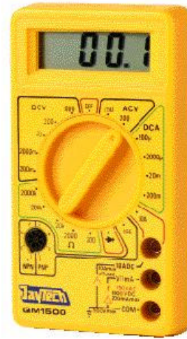
Part Number QM1500

Specifications: DC Voltage: 200mV, 2000mV, 20V, 200V, 1000V Max input: 1000V DC \pm 0.5\% . Overload protected \pm 2\% DC Amps: 200 \mu A, 2000 \mu A, 20mA, 200mA, 10A Overload protected \pm 2\% AC Volts: 200V, 750V, max input 750V rms input imped. 1 Meg \pm 1.2\% Resistance: 200 \Omega , 2000 \Omega , 20K, 200K, 2000K \Omega \pm 1\% Dimensions: 68 x 125 x 23mm.