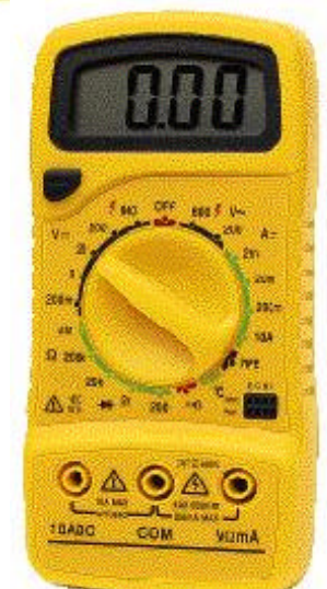
Part Number QM1525

Specifications: DC Voltage: 200mV, 2V, 20V, 200V, 600V \pm 0.5\% . Overload protected 250V RMS for 200mV range. 600V DC RMS AC for other ranges DC Amps: 200 \mu A, 2mA, 20mA, 200mA, 10A \pm 1\% on most ranges. Overload protected (not 10A). AC Volts: 200V, 600V, \pm 1.2\% . Overload protected. Resistance: 200 \Omega , 2K \Omega , 20K, 200K, 2M \Omega \pm 0.8\% . Overload protected. Diode and transistor test. Dimensions: Size 138 x 69 x 31mm.